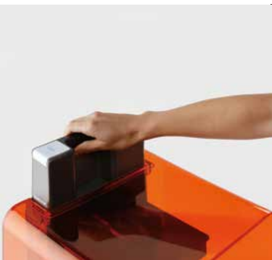
▲ Automated Resin System

POWER REQUIREMENTS: 100 - 240 V 1.5 A 50/60 Hz 65 W