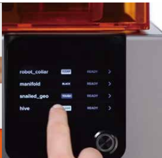
▲ Wi-Fi Print and Touch Screen Control