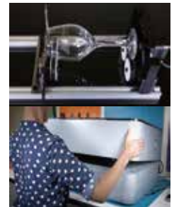
Rise and Rotary Attachment (Optional)